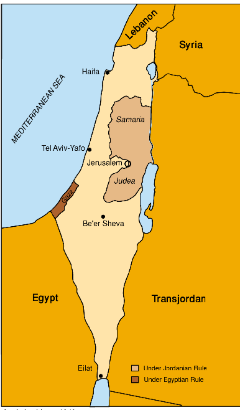
Armistice Lines, 1949